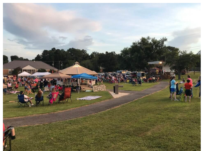
Hayden Community July 4 th Celebration

Thank you to the Town of Hayden for providing the use of the Community Center for these gatherings at no charge. Continuation after the 3 months will depend on participation and interest.